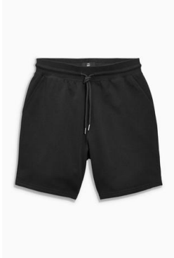
Shorts – Plain black shorts/skorts with no logos

This is so we can show who we represent in local competitions and also show our pride in being part of the Mercenfeld Primary School Community.