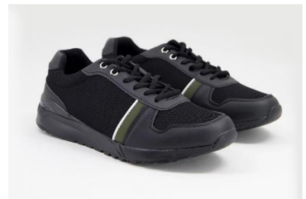
Trainers An inexpensive black pair of trainers for outdoor P.E.

PE Kit with the Mercenfeld Logo is available but not essential.