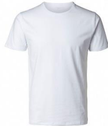
T-shirt – White with or without the school logo (no other logos)