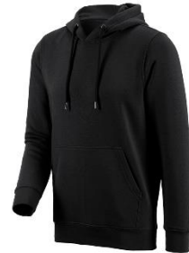
Sweatshirt – Plain black with no logos