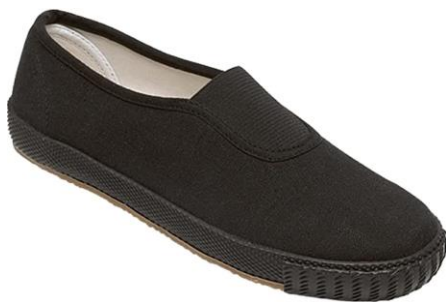
Pumps Elasticated black PE pumps