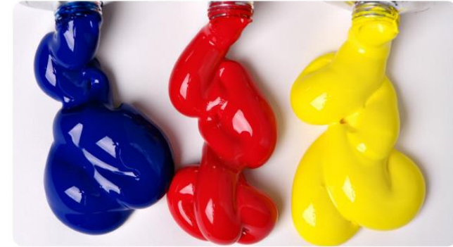
There are lots of different colours. Blue, red and yellow are called primary colours.