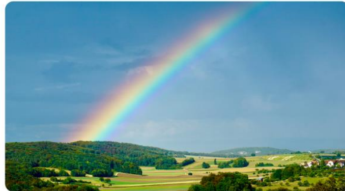
Rainbows can appear in the sky when it is sunny and rainy at the same time.