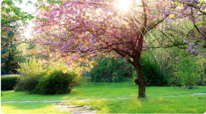
Spring is a season.

‘Know more and remember more’ about these interesting facts about spring and colours.