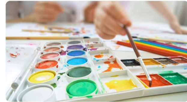
Colours can be mixed to make new colours. Mixing yellow and blue makes green. Mixing red and blue makes purple. Mixing yellow and red makes orange.