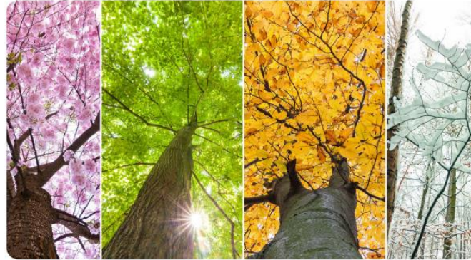
There are four seasons. They are spring, summer, autumn, and winter.