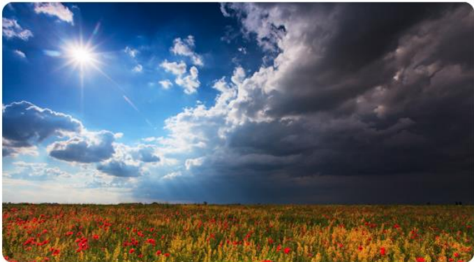
You can get all types of weather in the spring. Different types of springtime weather include rain, sun, wind, hail, sleet and snow.